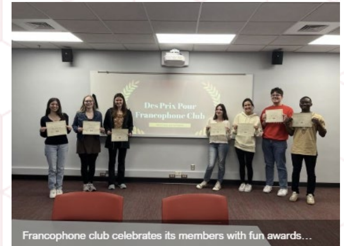
Francophone club celebrates its members with fun awards...

Students can practice their French at Francophone clubs conversation hours twice per week and cultural events once per month. You can read the latest Francophone Club and Pi Delta Phi updates in their self-published newsletter and follow them on Instagram during the academic year @isupideltaphi .