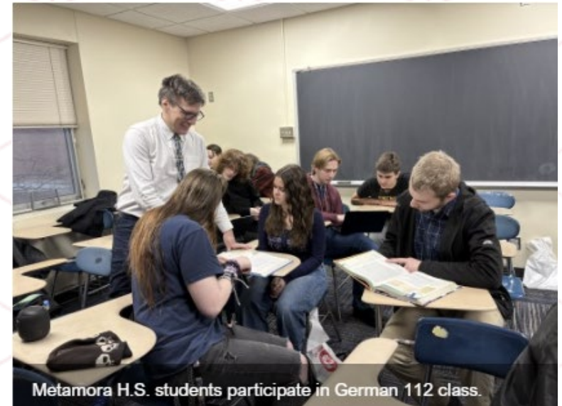
Metamora H.S. students participate in German 112 class.