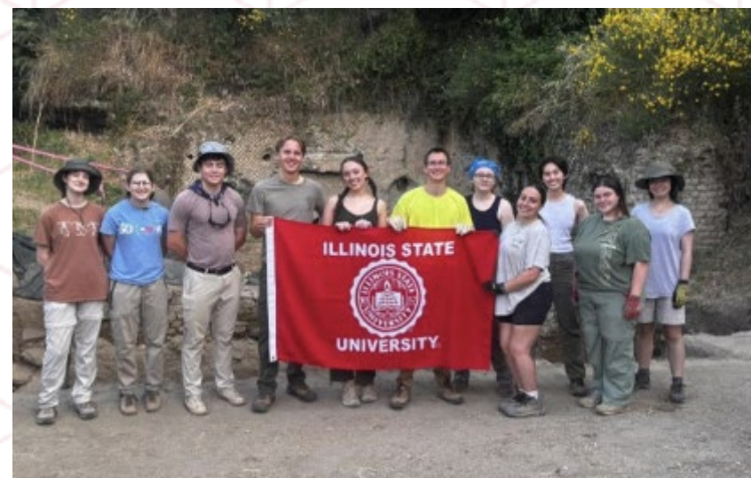
ISU students and archeological dig participants of the field school program in Gradoli, Italy.