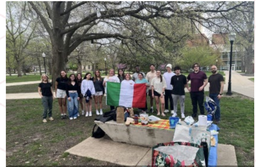
Students gather for Pasquetta on the quad for an Italian-style picnic with pasta, caprese salad and an authentic dessert flown in from Italy! They followed the feast with a treasure hunt (in Italiano, of course!)

The Italian Club La Tavola hosts twice-weekly conversation hours, monthly cultural events and three Italian films per semester, all with strong and enthusiastic participation. Some of this year's cultural events included: making homemade pasta, Italian renaissance painting night, a presentation on the Arbëresh people, language, and culture, and celebrating Pasquetta, and honoring our laureati with hand-made laurel crowns, which symbolize the hard work, dedication, and achievement of the graduate's intellectual success. Read more about La Tavola in the club's newsletter and follow their weekly updates on Instagram during the academic year @isu_italianclub .